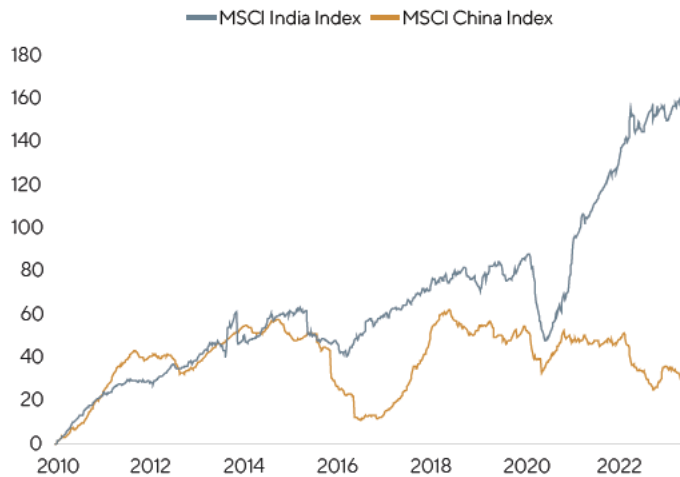
MSCI India versus MSCI China – Forward Earnings Growth

For the time period January 2010 through June 2023. You cannot invest directly in an Index. Past performance may not be an indicator of future results.